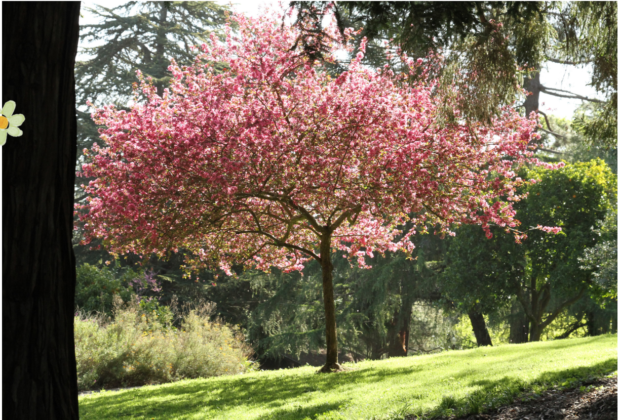
Spring blooms in Upper Gerstle Park!