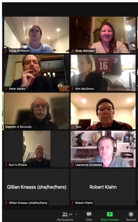
Our 2022 Annual (Zoom!) Meeting

The GPNA is a 100% volunteer commitment, and